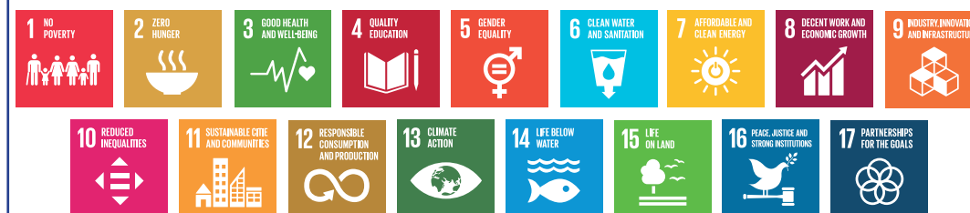
Box 1: The 17 Sustainable Development Goals (SDGs)