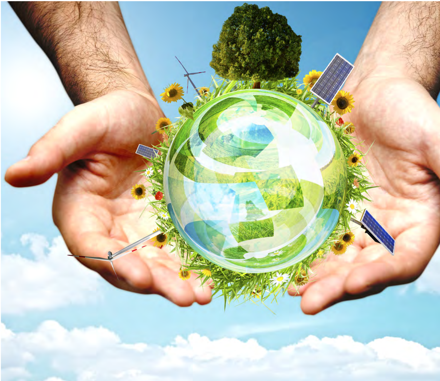
Green planet.

the US-China Clean Energy Forum has advanced the idea of establishing a joint intellectual property protection program, with insurance jointly written by US and Chinese entities (for example by the US Overseas Private Investment Corporation and by People's Insurance Company of China), to lend credibility to IPR protection regimes.