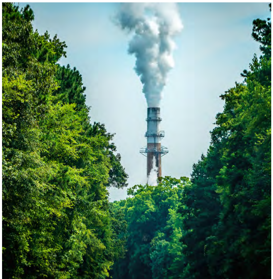
Greenhouse gas.

For the first time, the issue of loss and damage, which is concerned with averting, minimising and addressing the loss and damage arising from extreme weather events and other events caused by climate change, has been given a stand alone provision in the Agreement. This is a significant political