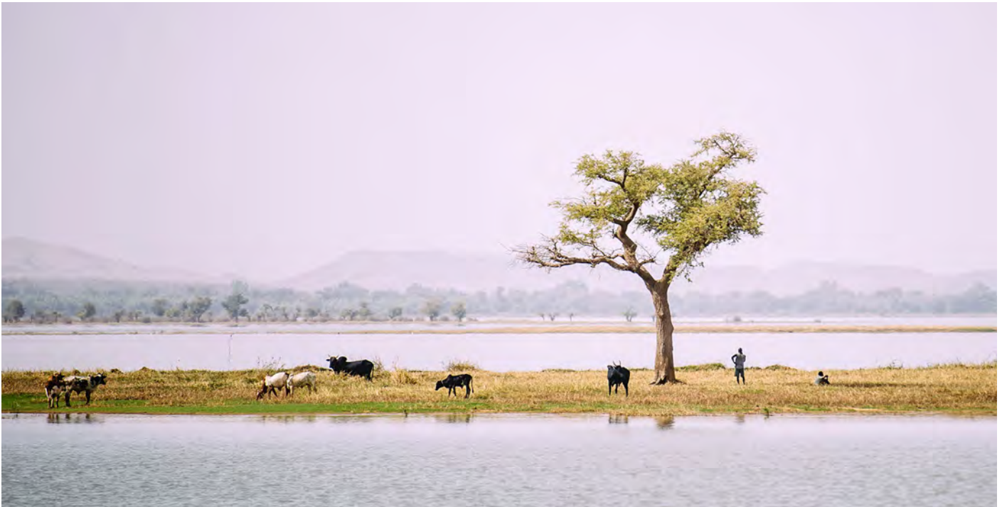
Lake Bam, Burkina Faso: enormous environmental challenges such as silting, drastic reduction of aquatic life and conflicts of interest threaten the livelihoods of the 28,000 people living from this lake.

2015, disaster aid rose for a second year running to a record US$24.5 billion. Yet despite this rise, funding was not sufficient to meet needs. With increasing demands on development aid, it is unlikely that the international aid community can keep on increasing humanitarian aid budgets, instead it needs to ensure more efficient allocation of resources.