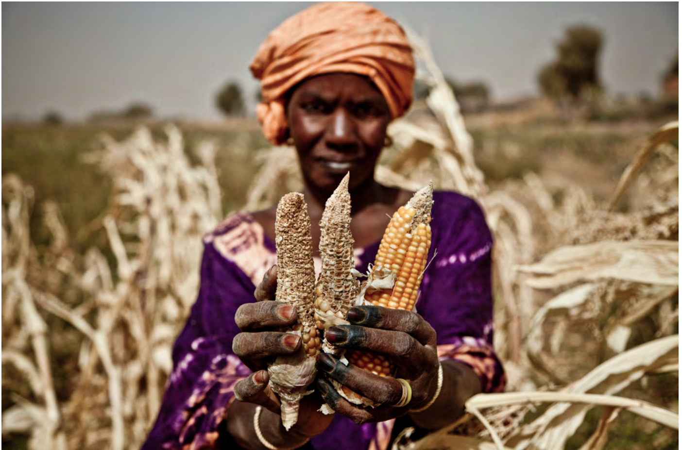
Sahel food crisis 2012: dried maize ears in drought stricken farm, Mauritania.

for Africa is to translate that momentum quickly into the agriculture sector. This should be central to a holistic and comprehensive transformation of African economies.