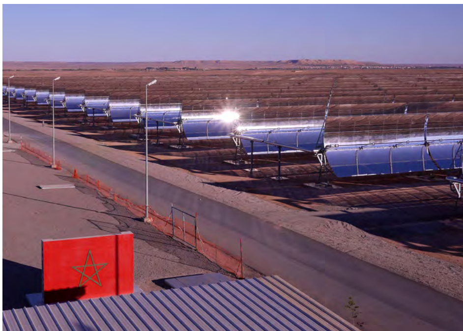
Ain Beni Mathar thermo-solar power plant, Morocco.

The international community's tireless efforts to bring about a universal multilateral climate agreement finally paid off. But now comes the hardest part: putting our promises into action.