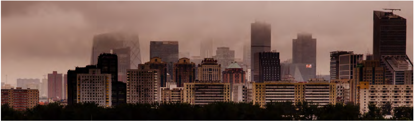
A smog filled Beijing.

The Paris climate agreement marks a momentous breakthrough and a civilising milestone in the history of the international community. It provides the gateway to a decarbonised global economy and society, sets ambitious goals for climate change mitigation, and yet its success is not a foregone conclusion. Significant efforts will need to be undertaken at local, national and international levels in the next few years and decades for effectively phasing-out a fossil fuel-driven economy.