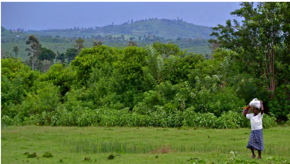
CCAFS climate-smart farm, Western Kenya.

focal point at the Ministry of Agriculture underlined Madagascar’s advancement with the Framework. However, administrative hurdles are stalling the process. The Ministry is waiting for an independent technical assessment. As long as this is not done, the Framework cannot be presented to potential funders of CSA projects. Another big challenge that Madagascar is facing is scaling-up the many small climate-smart projects on the island’s huge territory. The FAO is working on bridging the various initiatives, but progress has been slow.