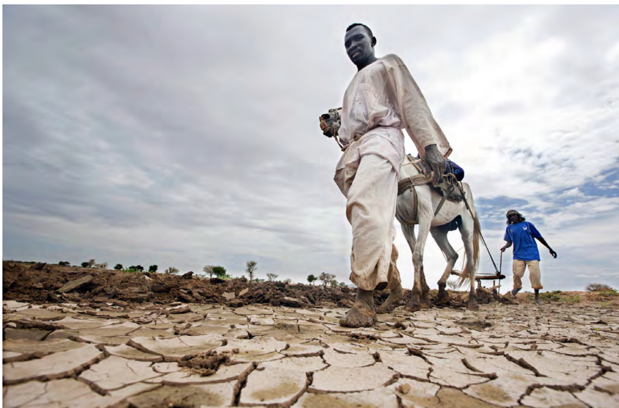
Men displaced from Shangil Tobaya farm rented land for the rainy season in Dali, close to Tawila in the Sudanese state of North Darfur. They are part of a community of displaced persons who have set up camp in Dali, fleeing the heavy fighting that took place in Shangil Tobaya (North Darfur) in early 2011.