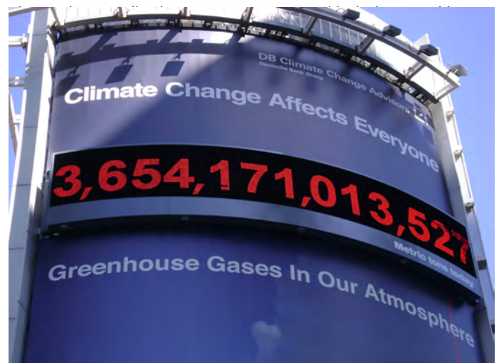
Greenhouse gas counter.

Parties agreed under article 2.1 (a) of the Agreement to keep global temperature increase well below 2°C and to pursue efforts to limit it to 1.5°C. The target of 1.5°C offers hope for developing countries, particularly in Africa. It will produce fewer climate extremes for farmers in the tropics who are adversely affected by heat waves, floods, and cyclones. But achieving this target requires gigantic efforts which sadly are missing in the Agreement. Even the target of 2°C will not be delivered if one were to go by the countries' current pledges under the Intended Nationally Determined Contributions (INDCs). Paragraph 17 of the Paris Decision Text "... notes with concern that the estimated aggregate greenhouse gas emission levels in 2025 and 2030 resulting from the INDCs do not fall within least-cost 2 degrees Celsius scenarios but rather lead to a projected level of 55 giga tonnes in 2030". Obviously more needs to be done and the leadership in this regard has to come from developed countries while developing countries